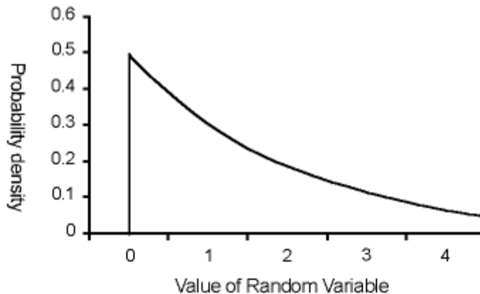
Figure 18.1. An exponential distribution with mean 2.

The exponential distribution plays a key role in the models we will consider. For the infinite source case, we assume that the times between successive arrivals are distributed according to the exponential distribution. An exponential density function is graphed in the figure 18.1: